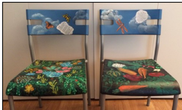
Sandy Herbst painted 2 chairs with a garden theme. They are called "Succulents and Such" and "Veges Plus." They are painted with outdoor safe paint and sealed with polyurethane.